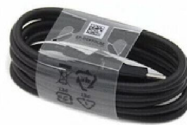
USB Cable (Type-C)

DISCALIMER: Specifications and product details are subject to change without prior notice. AGM strives to ensure the accuracy of the information presented, but we do not warrant or guarantee the completeness or correctness of the content. Customers are encouraged to verify product specifications and availability with AGM representatives.